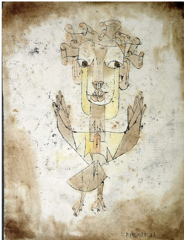
Paul Klee, Angelus Novus , 1920, watercolor.