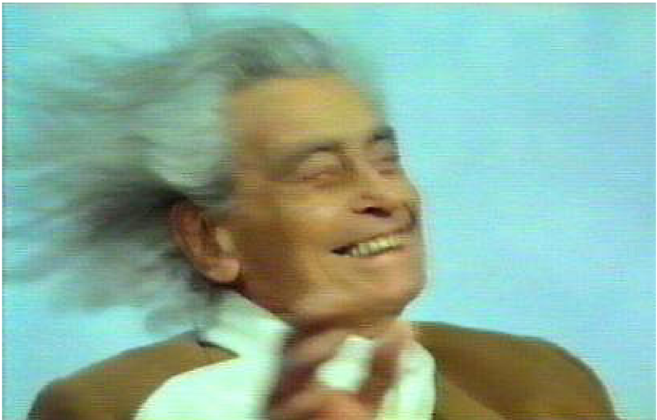
Joris Ivens and Marceline Lorian, Une histoire de vent (A Tale of the Wind), 1988.