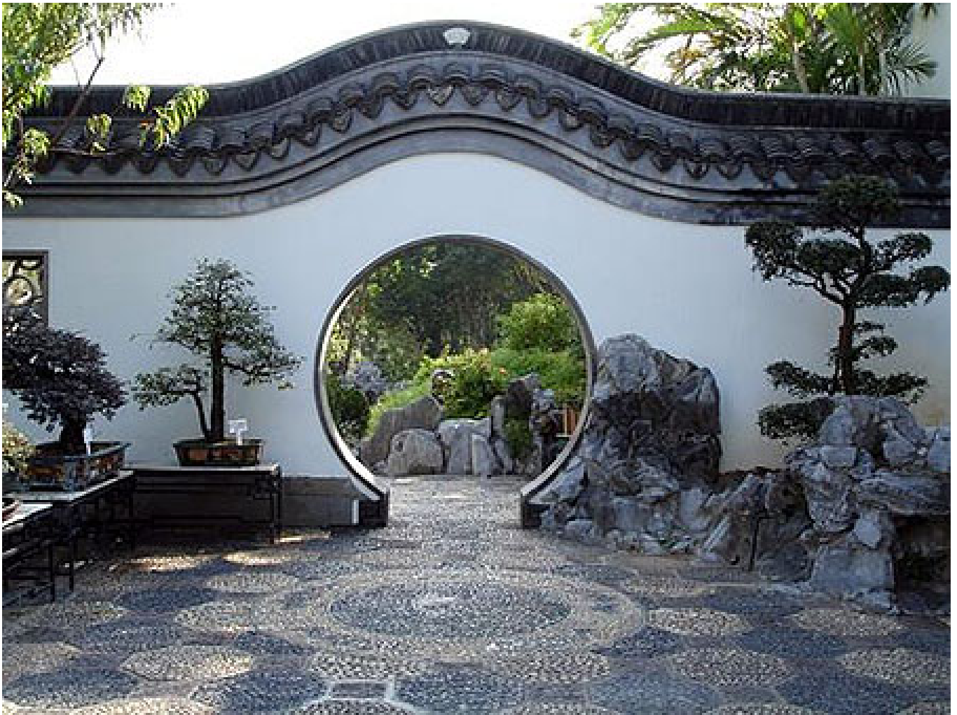
Kowloon Walled City Park.