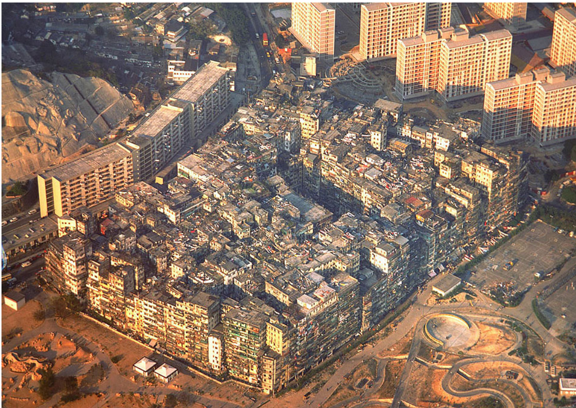
Kowloon Walled City, Hong Kong, seen from the air in the 1970s.

Typically, forms of belonging and solidarity that rely on the categorical exclusion of a notional other to cement their constitutive bonds are instances of amnesia. They are premised on