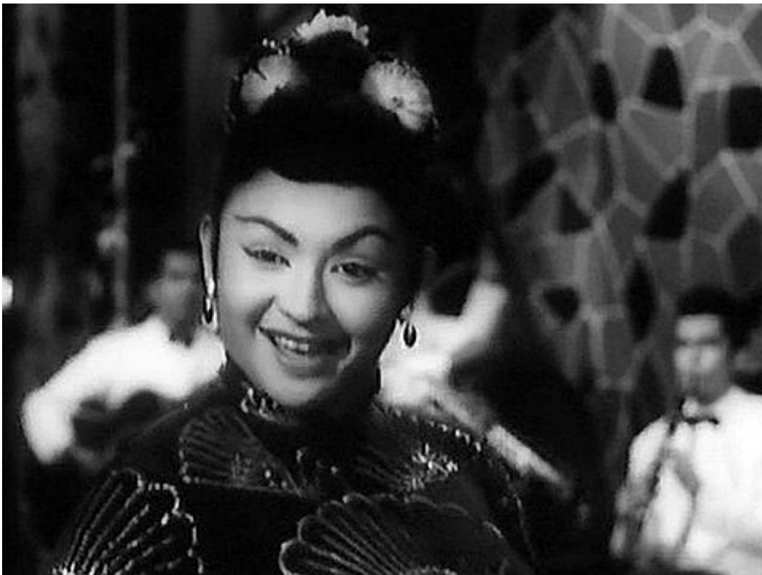
Actress Helen singing My Name is Chin Chin Choo in Howrah Bridge , 1958, Directed by Shakti Samanta.